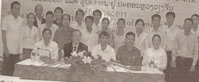
Officials pose together at the training course in Vientiane.

Get rid of stagnant water to prevent dengue fever